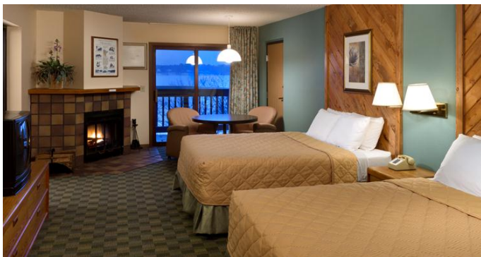
Lakeview Fireplace Room

To encourage attendance at the 2013 convocation the HRCJ Family Association will again offer an Assistance Program to help offset some of the cost. To participate, please note this on the back of the registration form and the Association will cover $100 of lodging costs at check-in at Cragun's next July. Conversely, members who would like to help fund this program should add whatever amount they would like to contribute with their registration check of $100.